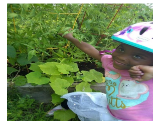
Home Garden Program