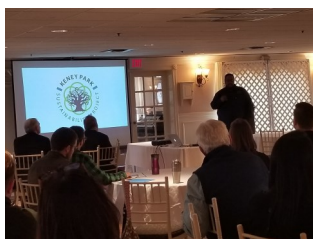
Urban Forestry Conference