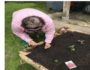
Home Garden Program