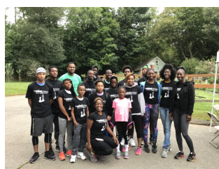
Golden Eagle Athletics