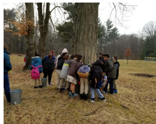
Hartford Maple Club