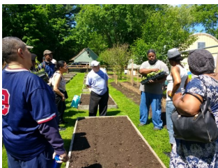
"Eats on the Streets"